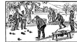
Boule court in allée