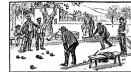
Boule court in allée

2007 Eleventh Avenue South—Birmingham, Alabama Tuesday—Thursday 11:00-10:00 Friday 11:00-10:30 Saturday 4:30-10:30 Closed Sunday—Monday 205-939-3221